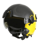
Gentex ALPHA 900 SAR