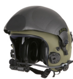
Gentex ALPHA 900