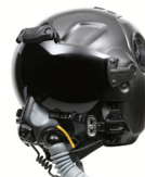
Gentex Next Generation Fixed Wing