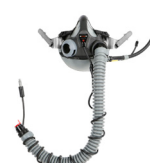
Gentex O2 Masks & Components